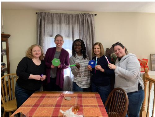
Pictured are North Shore Philharmonic Orchestra children's concert planning committee members...