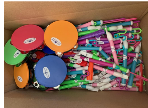
...prepping interactive musical giveaways for the children who come to the concert!