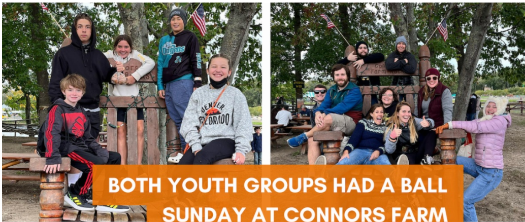
BOTH YOUTH GROUPS HAD A BALL SUNDAY AT CONNORS FARM

It is always fun to come to, and even more fun to work at for a two-hour shift with your church buddies. It is also a great way to get involved and meet new people.