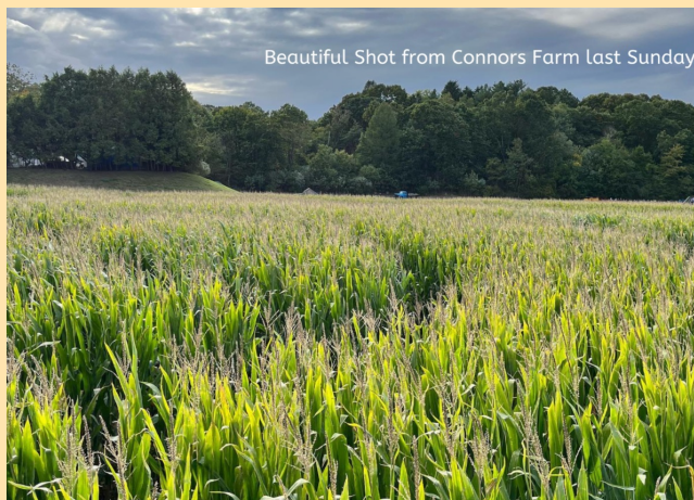
Beautiful Shot from Connors Farm last Sunday