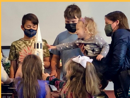
Children excitedly engaging with the replica!