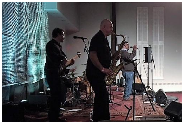
King of Rock and Soul, Beverly's own, Barrence Whitfield