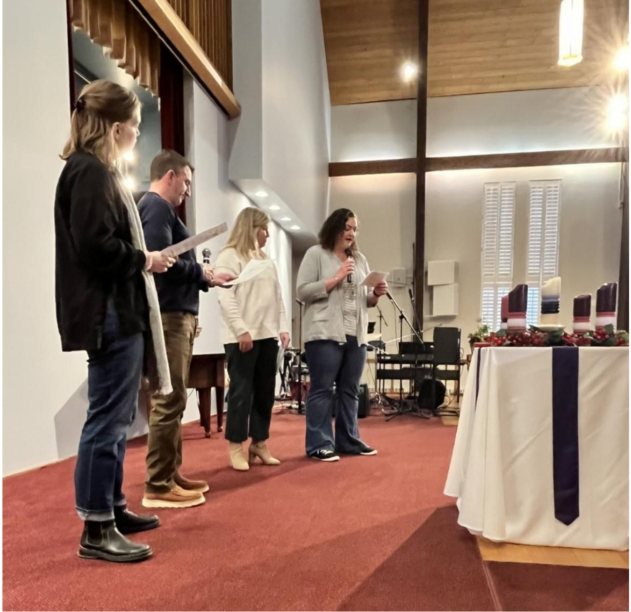
Above features FBC's Advent Worship Planning Committee Lighting the First Candle of the Advent Wreath.