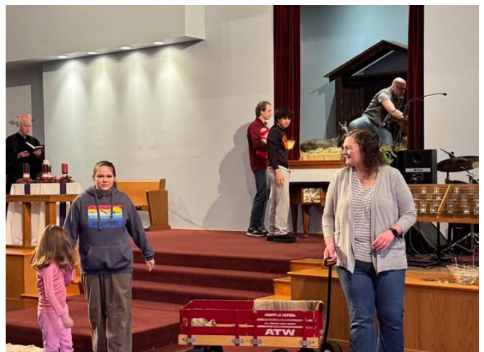
The Littlest Learners started building our Nativity Scene last week!